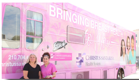
The MMU after its transformation.

Women are receiving life-saving breast health care because of your generosity. In January 2013, with philanthropic support, the CHRISTUS Santa Rosa Mobile Mammography Unit (MMU) underwent immense technological and aesthetic transformations. The outdated analog equipment was replaced with 2-D digital mammography, nearly doubling the amount of mammograms per month to about 300. Currently, the MMU provides approximately 3,000 mammograms per year, with more than one third provided for free to underserved and uninsured women. This is only possible thanks to you and your support!