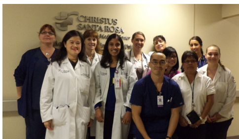
The ACE Center staff members.