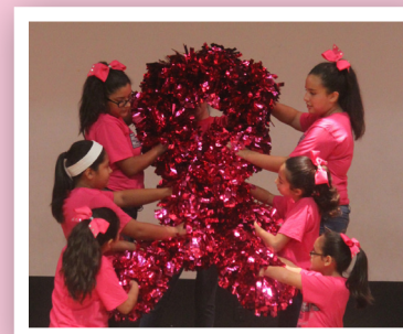
St. John Bosco Catholic School

In honor of Breast Cancer Awareness Month, students and faculty at local Catholic schools raised money to benefit the CHRISTUS Santa Rosa Mobile Mammography Unit (MMU). Students at St. John Bosco Catholic School, St. Gregory the Great Catholic School, and St. Mary Magdalen Catholic School sold pink t-shirts to raise money and to spread awareness. We are grateful for the determination of these students to make a difference in the lives of the women we serve.