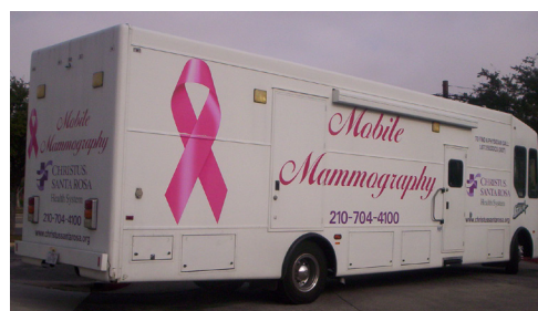
The MMU before its transformation.