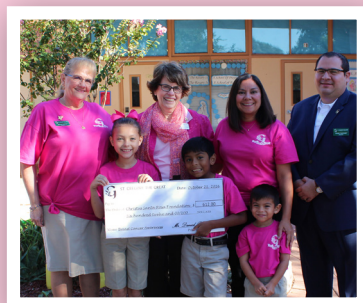
St. Gregory the Great Catholic School