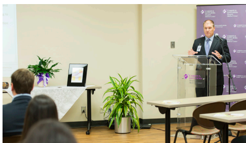
Blessing ceremony and news conference introducing the Kingman Center in 2014.

In 2014, the Hazel and Fred Kingman Education and Conference Center was developed to serve as a fully-equipped multimedia education and conference center dedicated to providing pre-operative patient education, patient activities, and team conferences. The center serves as a teaching space for all patients receiving care at The Orthopedics and Neurosciences Center, also referred to as the Acute Care for the Elderly (ACE) Center Without Walls, and is outfitted with special floors, lighting, furniture, and a nursing staff specially trained in the needs of the geriatric patient population, providing specialized care to patients age 65 or older. Your generous donations allowed these important developments to come to fruition.