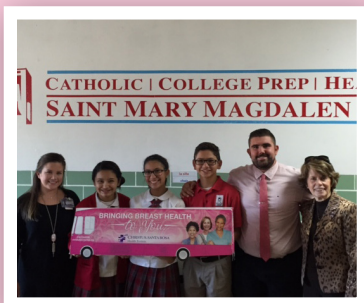
St. Mary Magdalen Catholic School