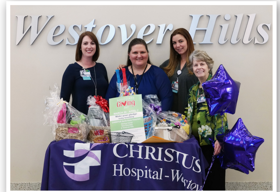
The Friends Foundation and CSRH - WH Associates host Associate Giving information booth.