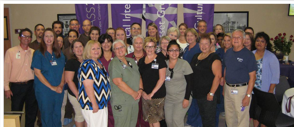
Associates representing CHRISTUS Santa Rosa - New Braunfels

For more information about sponsorship opportunities and individual tickets, please call 210.704.8808 or email FriendsFoundation@ChristusHealth.org .