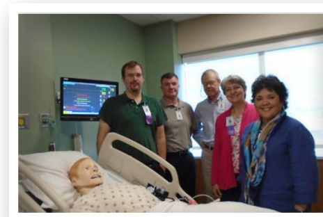
CPE residents enjoy an educational experience in the SIM Lab as part of their program training.