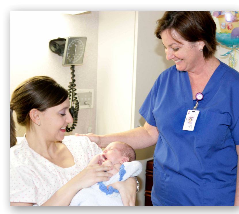
CSRH - WH delivers approximately 150 newborns each month.

Specific needs of mothers in labor vary, case by case. Depending on the patient's body type and the position of the baby, the patient may require the use of wireless fetal monitors. These waterproof, wireless monitors eliminate the risk of infection and keep track of contractions and the fetal heart rate.